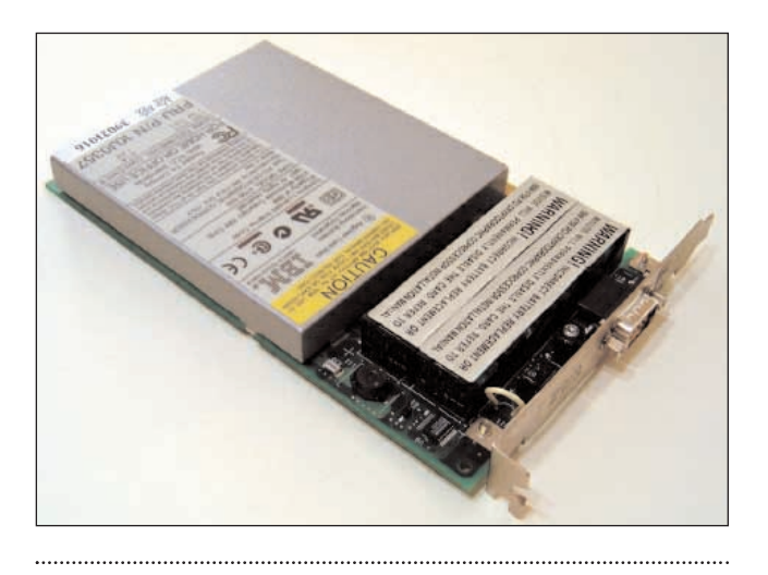
Figure 1. IBM's new SecureBlue technology adapts the security features of this IBM 4758 PCI card into licensable IP for SoCs. The PCI card is sealed inside a tamper-resistant metal enclosure.

IBM says the chip-level version of SecureBlue can duplicate virtually all the features of the 4758 card and even provide additional features. Of course, some of the more exotic security features don't make sense in everyday applications, so they are optional. A processor that automatically deletes sensitive information when x-rayed wouldn't be desirable in a laptop